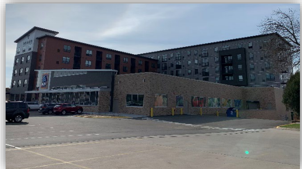
3: 2017 City of Chanhassen Redevelopment