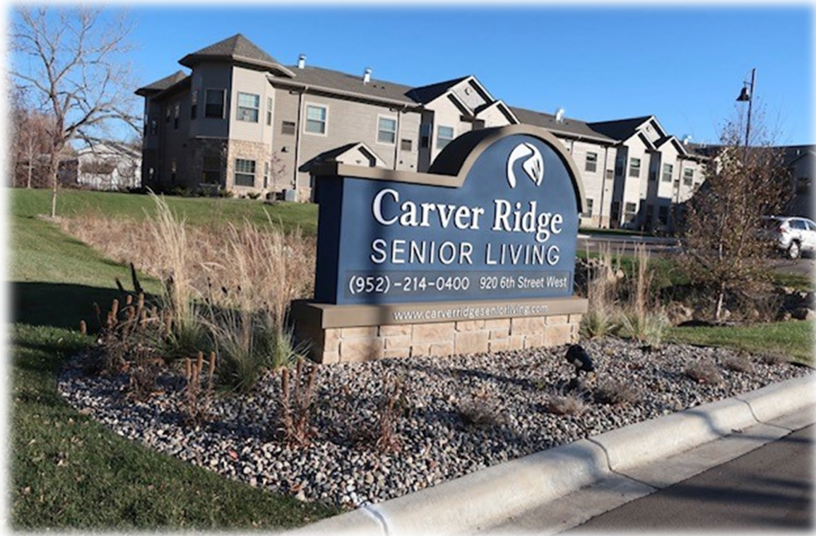
1: 2018 City of Carver Redevelopment