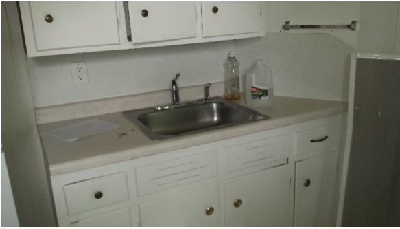
After kitchen and bathroom